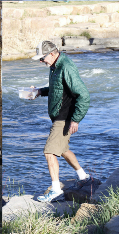
*Montrose Trout in the Classroom release